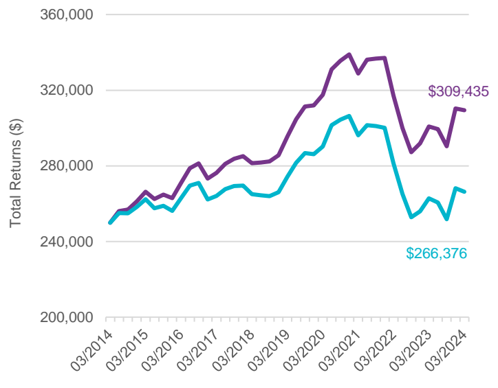
Gross of fees — Net of fees<sup>3</sup>

Performance data shown represents past performance and is no guarantee of, and not necessarily indicative of, future results. Returns shown are considered to be preliminary and are subject to change. Gross performance does not take into account transaction costs, investment advisory fees, custody fees, or other expenses that were charged to clients' accounts or deductions for income taxes. Such fees will reduce investment performance over time. Standard deviation measures the risk of a portfolio or market. Indexes are not investments and do not incur fees and expenses and are not professionally managed. It is not possible to invest directly in an index.